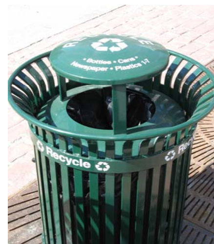
Eight new recycling bins feature clear labels and a bright green color.

City contractor who empties the trash cans empties the recycling bins, he will be able to easily separate the trash from the recycling,