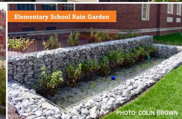
Elementary School Rain Garden