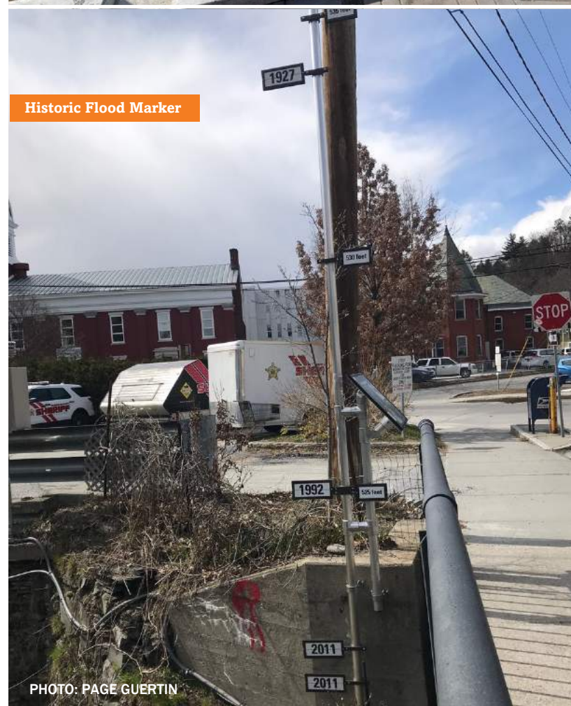
Historic Flood Marker