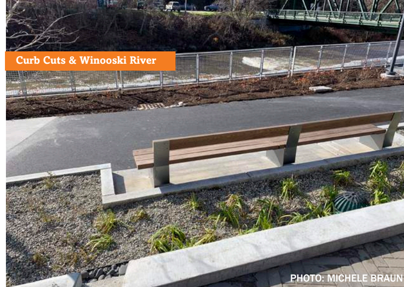
Curb Cuts & Winooski River

If you feel inspired to take action to install or maintain a green infrastructure practice on your land or in your community, visit the websites of the project sponsors to learn about current volunteer opportunities or to obtain guidance to help make your inspiration a reality.