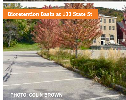
Bioretention Basin at 133 State St