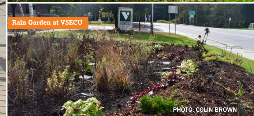
Rain Garden at VSECU