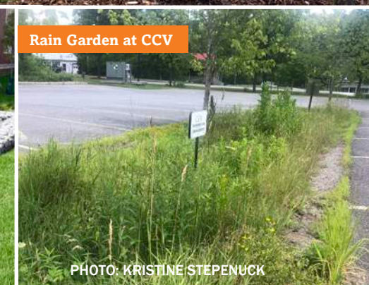
Rain Garden at CCV