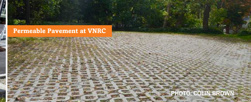
Permeable Pavement at VNRC